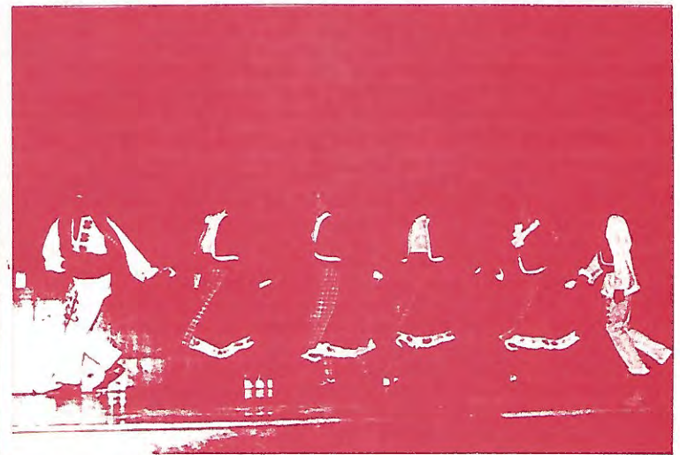
DRAVA BULGARIAN SUITE