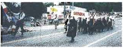
Serbia (What else)