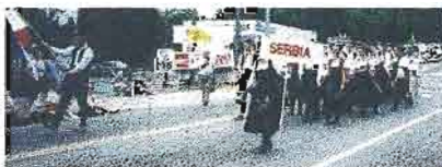
Serbia (What else)