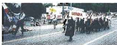
Serbia (What else)