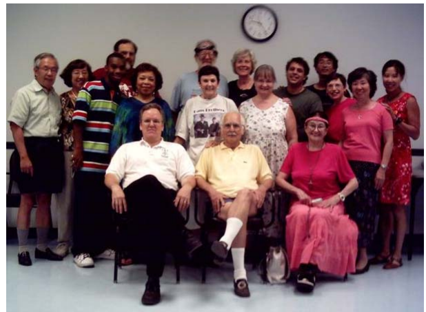
Group shot of the fabulous Friday night in Tampa.