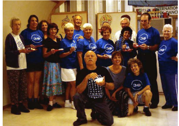
Orlando birthday party (not Bobby's - the one before)

all is well with the world. I'm leaving out all my personal stuff to give you all a break this month! See ya! T A