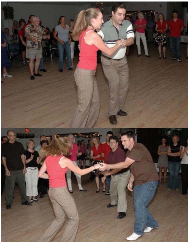
Aug. 28, 2005, a Sunday evening at Zendah Grotto Dance Hall, Tampa, FL To learn about swing dance in Tampa, go to www.swingang.com