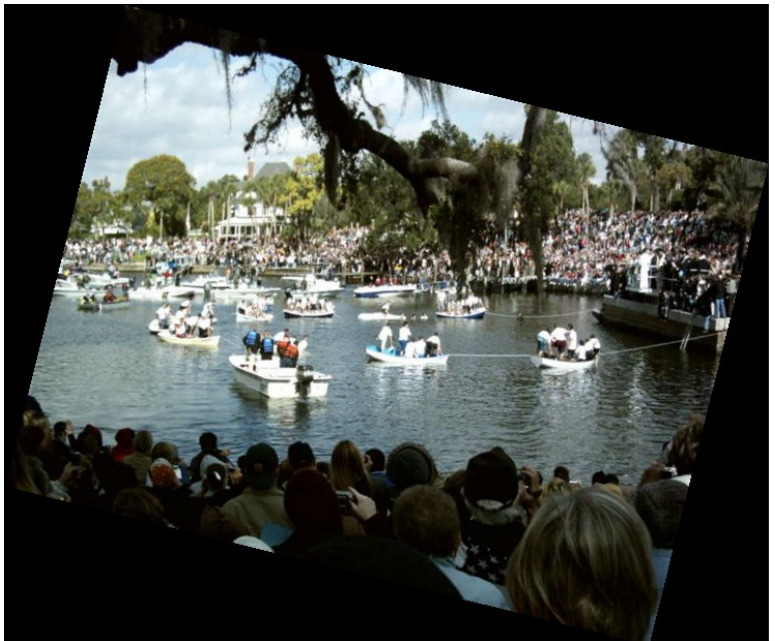
Ready to Dive for the Cross