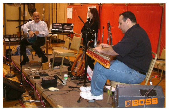
Band at Rang Tang