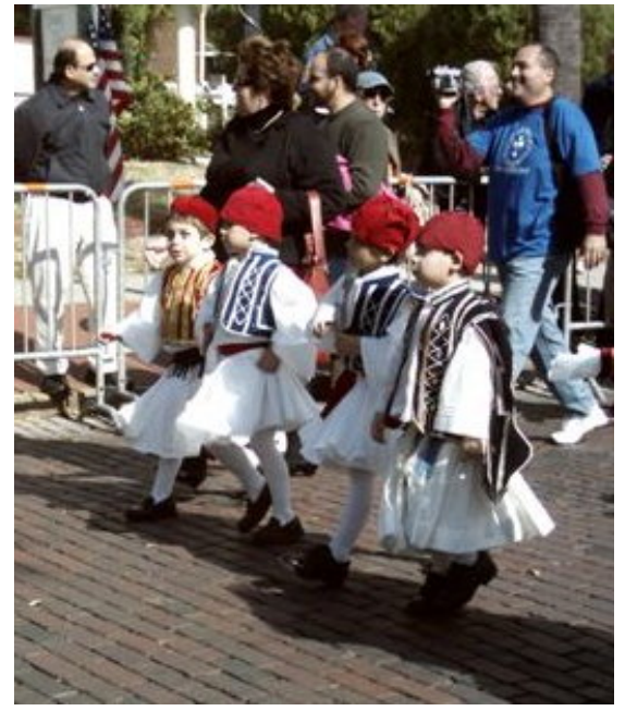
Future Greek Dancers

Dancers from Tampa and Orlando attended the 100<sup>th</sup> Epiphany celebration in Tarpon Springs in January and wrote about it in the February 2006 Florida Folk Dancer. Here are some pictures of the event, which included a parade, diving for the cross and Greek dancing.