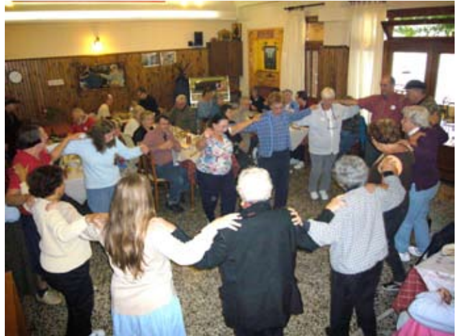
In a Restaurant under the Monasteries/Cliffs at Meteora

ancient ruins at almost every stop and visited the museums by the archaeological sites. This trip gave us the opportunity to see Greece (and Ephesus) in all its glory with the added dimension of dancing.