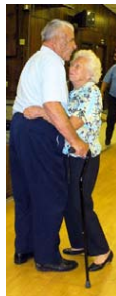
Real dancers never quit!

We ended the day by crossing the road to visit my daughter the groomer and