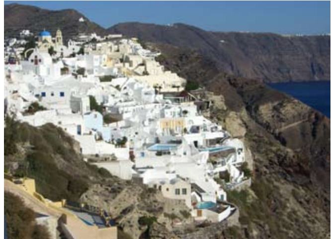
A Village on Santorini