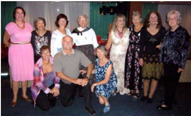
On Board the Cruise Ship

Those of you who have been to Greece know the sheer amazement of looking at structures and statues that are thousands of years old. We explored