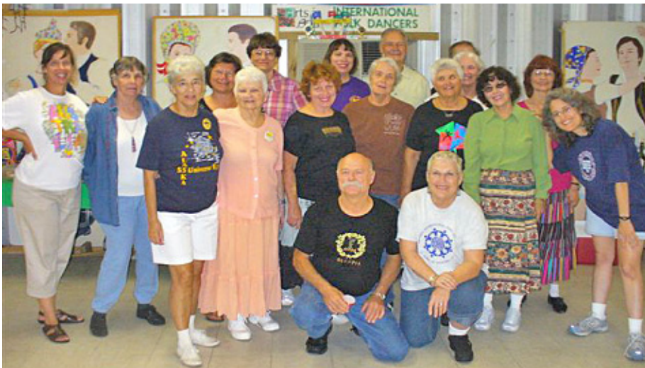
Bon Voyage Party