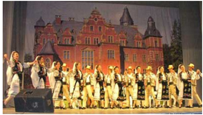
A performance in Romania