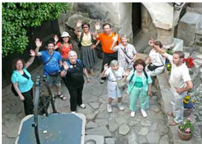
Part of the gang waving from Vlad Dracula's castle

When we were not dancing, we visited a farm home, with animals and vegetables, and went inside the home; we ate at a “rich” farm – a sort of B&B where we were served a piece of fat (hmmm); we drove through many villages, stopped for storks, water buffalo, donkeys and carts, haystacks. We went to some museums, some folk, some art, one outdoors which happened to have a huge folk art sale going on (did we shop!); Vlad Dracula’s castle (of course); the Women’s Cave, the Parliament in Bucharest, wonderful plazas in each city (why doesn’t the US have these?); and of course, we were led to various costume shops. The boot man visited us at our hotel, where some of us lucked out and bought fabulous shoes or boots; costumes were available on a couple of occasions, but we mostly bought in the antique area of Bucharest where the prices were great! We’re showing off at the next camp – even if there is no Romanian night!