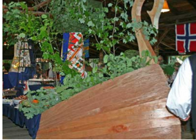
Smorgasbord table decorated as a Viking ship at Nordic Fiddles and Feet

At Nordic Fiddles and Feet, the festive dinner included a Viking ship smorgasbord with dishes including salmon, smoked herring and lingonberries, plus singing and toasting in Swedish and Norwegian.