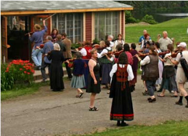
Musicians leading the procession into the dining room at Nordic Fiddles and Feet

The camps incorporate other aspects of Scandinavian culture, as well. There is usually a special Scandinavian dinner, with a traditional procession into the dining hall led by all the musicians.