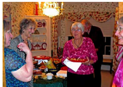
Gainesville dancers celebrated with a New Years Eve party at Jualene's House.