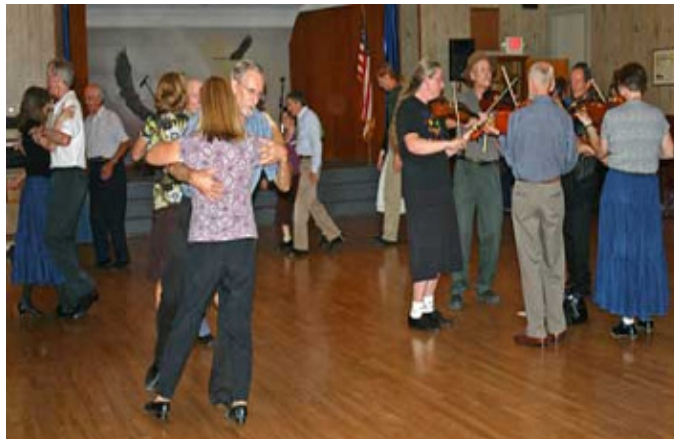
Scandia dance party in Seattle