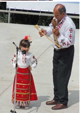
Top right: a dance group waiting to perform at the Koprivshtitsa festival; left: Ansamble Tchinari performing at dinner in Sofia; center: dance group performing; right: a young singer and her accompanist