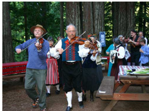
Musicians leading the procession into the dining hall for the banquet

Another nice feature of this year's camp was the number of younger people there. The Swedish dance and fiddle teachers (two married couples) brought four of their children with them. The three sons of the fiddle teachers played fiddles, too. There were also two young (twenty-something, I think) musicians. The quality of all the musicians was very fine. We had wonderful live music for everything, even our morning warm-ups!