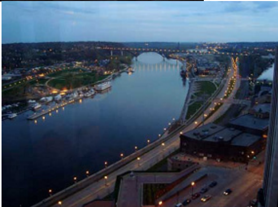
Views from the conference hotel: top: view of St. Paul with Cathedral of St. Paul at left; above: the Mississippi River.

We had no idea what the conference would be like. We expected hundreds of people – turns out only 31 lovers of folk dance and lore signed up. But what dynamic people they were! One started and runs the Stockton Folk Dance Camp; there were directors of performing groups; and people who have taught folk dance for 30 years.