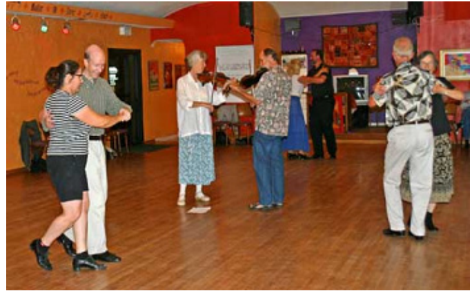
Scandinavian Dance Party in San Diego

We were sorry to miss the Flagler Fling while we were in California. It seems to have been a resounding success! (See Fun at Flagler Fling .)