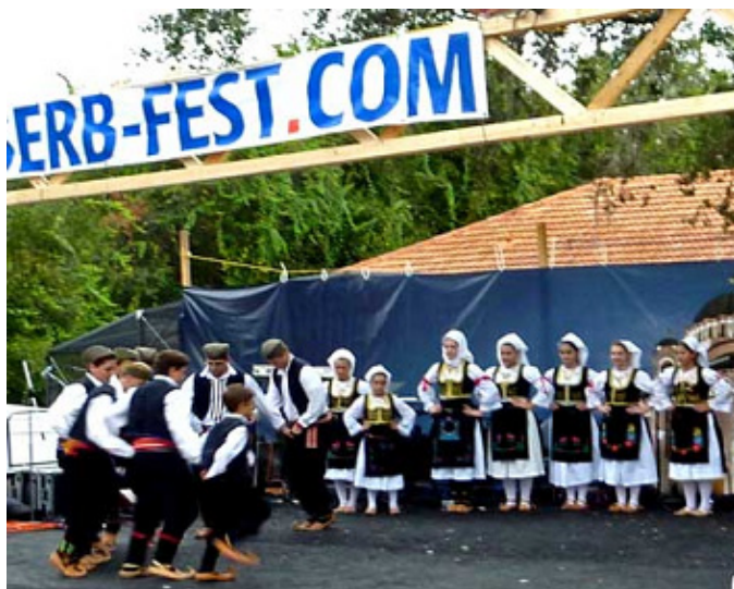
Dance group performing at Serb Fest.