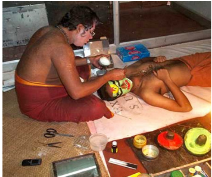
Kathakali performers putting on makeup.

Our group went early and got to watch them get their makeup and put costumes on. Makeup can take up to three hours; we saw about a half hour’s worth. We also got to have our picture taken with one of the actors afterwards.