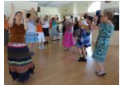
Guess what dance this is