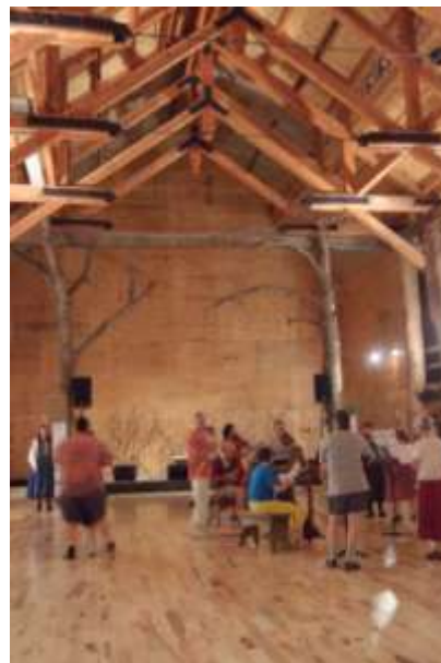
Ogontz Hall out and in - wow! 'nuff to make you wanna go!