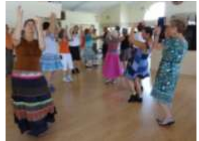
Guess what dance this is