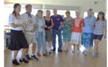
We love our lines