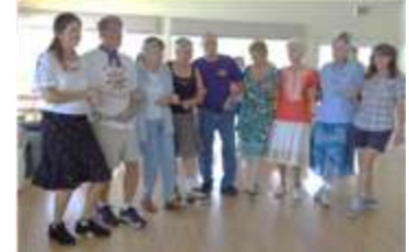
We love our lines