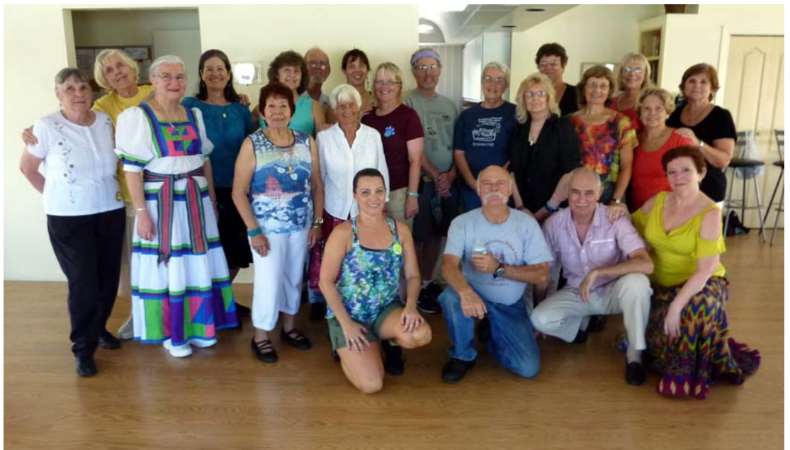
Dancers at Flagler Fling

“We're certainly lucky to have this fantastic opportunity to share our dances with each other.”