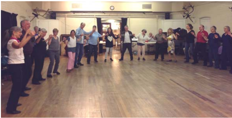
Balkanplus Dancers at Cecil Sharp House in London

their once-a-month meeting that evening. It took me three buses—luckily I had bought a London Oyster card for transit—and I only had to ask for directions once. I found the community center where they were dancing, where I spent a lovely three hours being graciously welcomed into their group and getting over my jet lag by dancing.