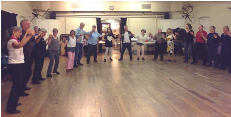
Balkanplus Dancers at Cecil Sharp House in London

their once-a-month meeting that evening. It took me three buses—luckily I had bought a London Oyster card for transit—and I only had to ask for directions once. I found the community center where they were dancing, where I spent a lovely three hours being graciously welcomed into their group and getting over my jet lag by dancing.