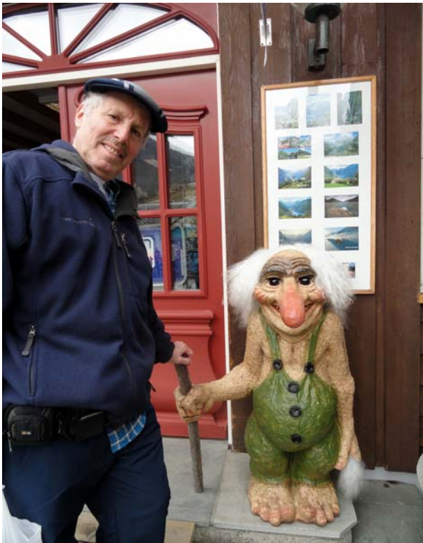
Friendly Troll in Geiranger, Norway