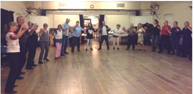
Balkanplus Dancers at Cecil Sharp House in London