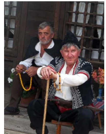
Bulgarians watching the Koprivshitsa Festival.