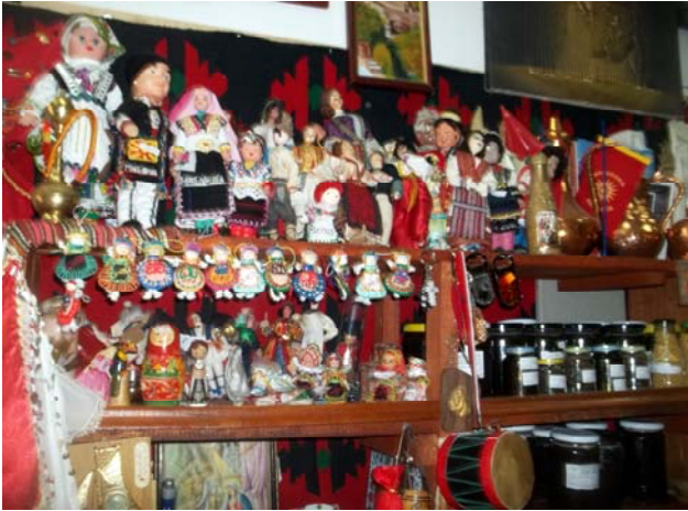
Shopping for dolls in Sophia, Bulgaria on BMG trip.

famous Pletenka group for another dance event. They danced for us, showed us in detail their costumes, and gave us a dance lesson as well. They apparently didn't know we could dance, so did easy stuff, but it was still fun. They gave us souvenirs, as well as the words to the dance "Bitola"- which was great! The tour afterwards included a thriving Jewish