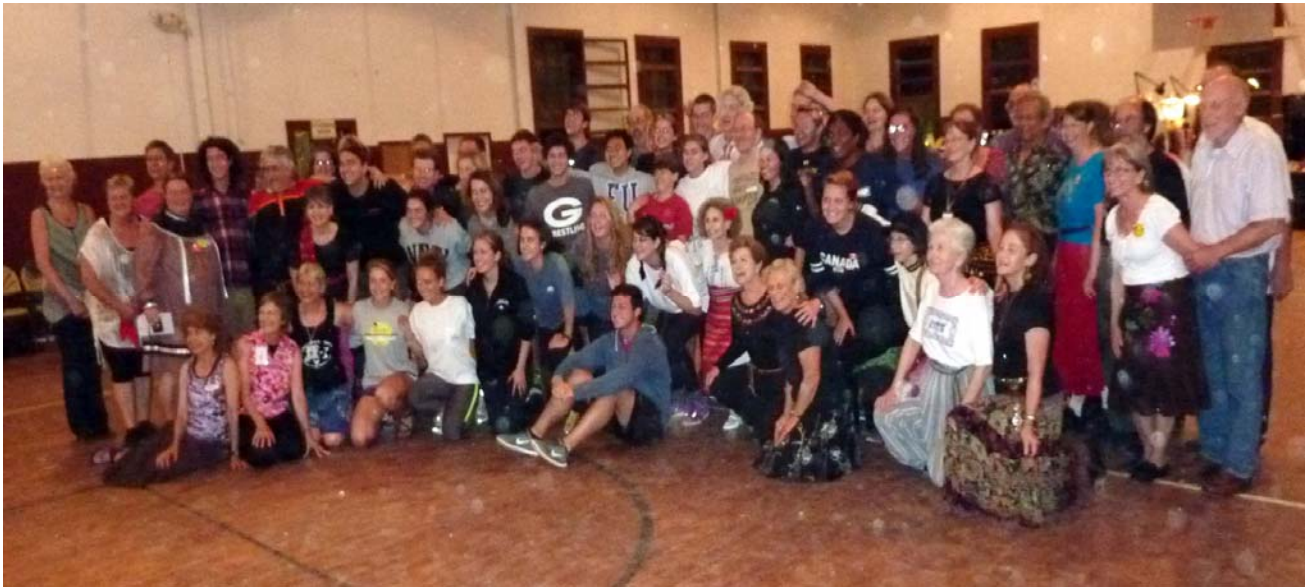
Playshop Attendees.