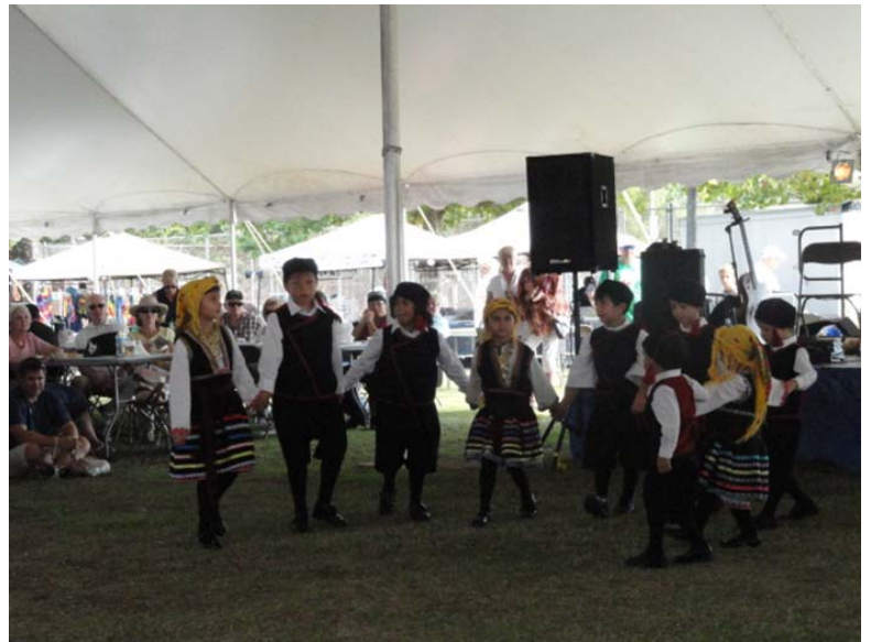
Children dancing at St. Augustine Greek Festival.

You can keep up with our schedule at www.gifd.org where the calendar lists the next three months' worth of dance dates. The Gainesville group was also featured in a short article on the Friends of Florida Folk website at: http://foff.org/index.php/news-blog/434-international-folk-dancers .