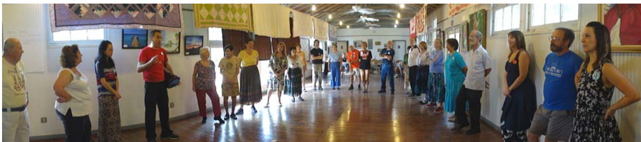
Panoramic view of dancers at Christos workshop.