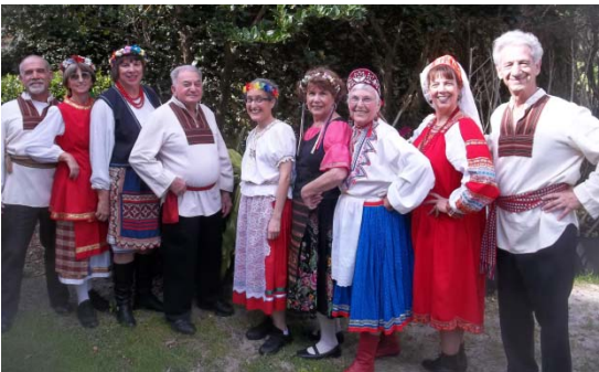
Orlando group and friends at Russian performance