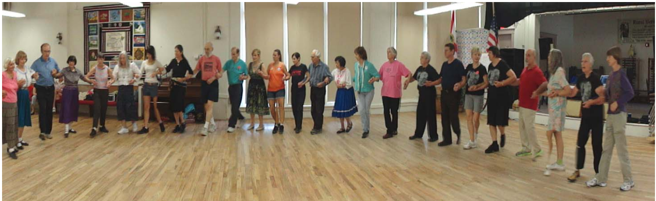
Spring Fling Dancers