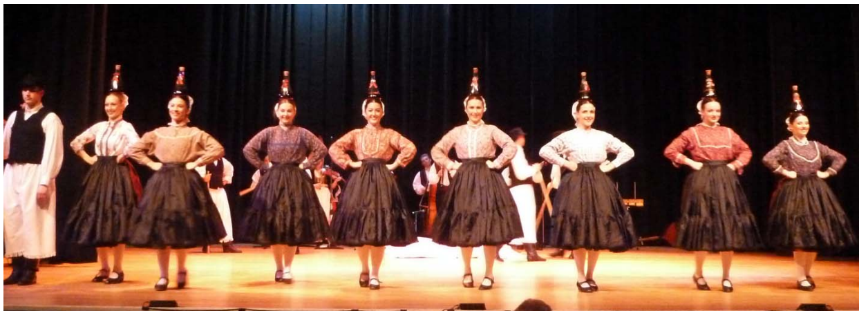
Tamburitzans' Hungarian Bottle Dance