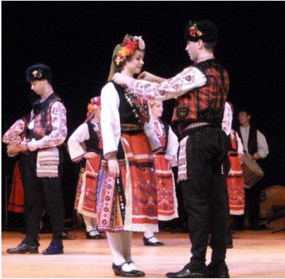
Tamburitzans' Thracian dance