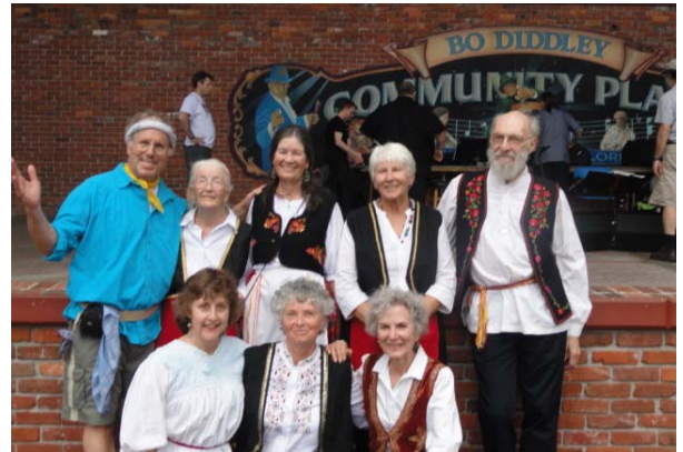
Gainesville dancers at Bo Diddley Community Place