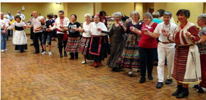
2014 Camp attendees in their party finery