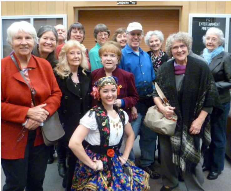
Some of the Florida folk dancers who attended the Tamburitzans' Lake City performance [with a Tamburitzan]

Everyone left smiling, inspired and energized. The exuberant show delighted everyone attending the performance. This continues to be the show to see every spring break!