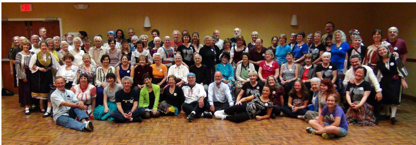
2014 Camp attendees