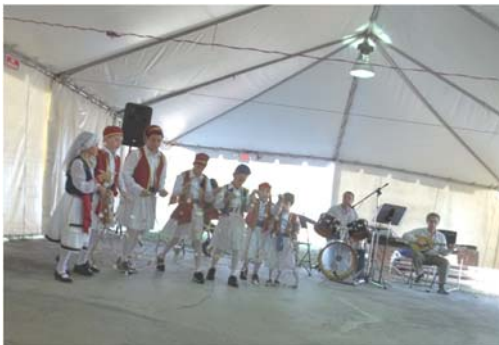
Children dancing at Winter Haven Greek Festival