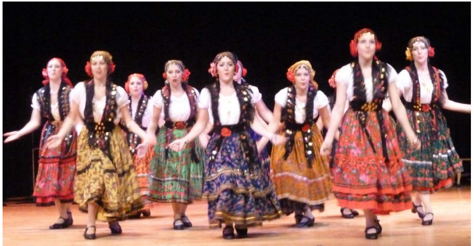
Tamburitzans' gypsy dance

We could tell watching the smiling faces of the dancers twirling in colorful costumes, their love of folk dancing. Each dance was introduced with a description of the region/country and pertinent facts about different cultures. Dance after dance we were delighted with the energetic steps and the variety of the show. The orchestra of talented musicians and the singing that accompanied the dances contributed to a most pleasurable evening.