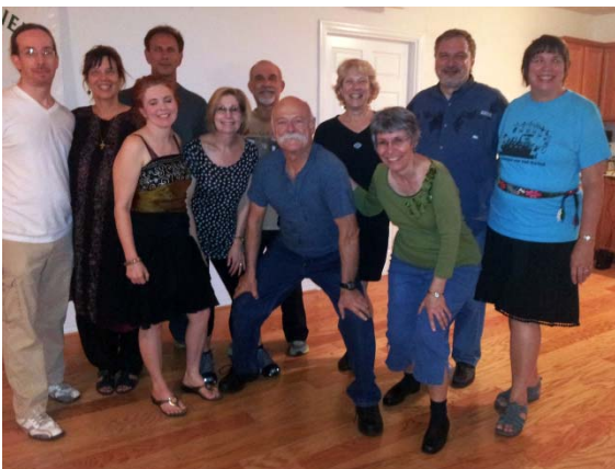
BIG day for DeLand Folk Dance on April 22: Lucky 13!

I was privileged to join an ensemble a cast of truly exceptional talent in The Athens production of Les Miserables. It was an extraordinary epic theatrical experience. We opened April 4th and ran for four weeks. A number of folk dancers attended BOGO night on Thursday, April 10.