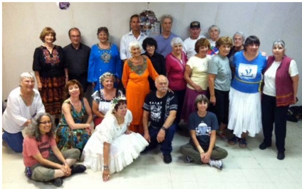
Orlando World Dance Day celebration