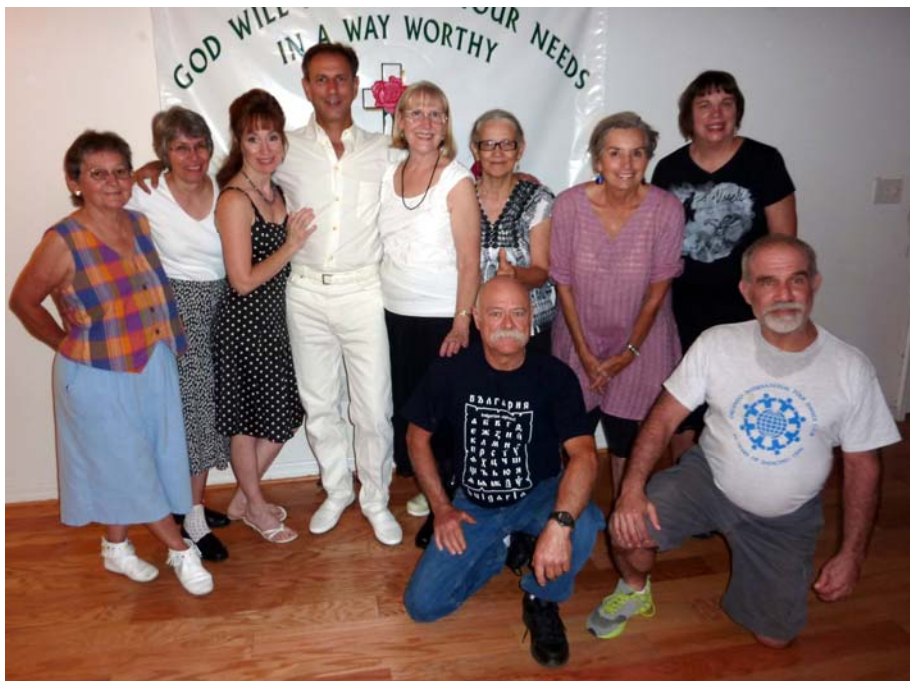
Deland group at Black and White party