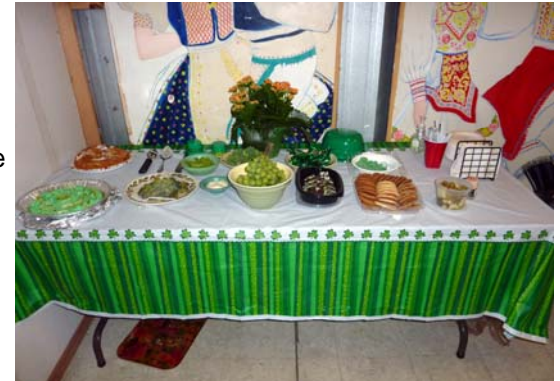
An assortment of green goodies for Orlando St. Patrick's Day party