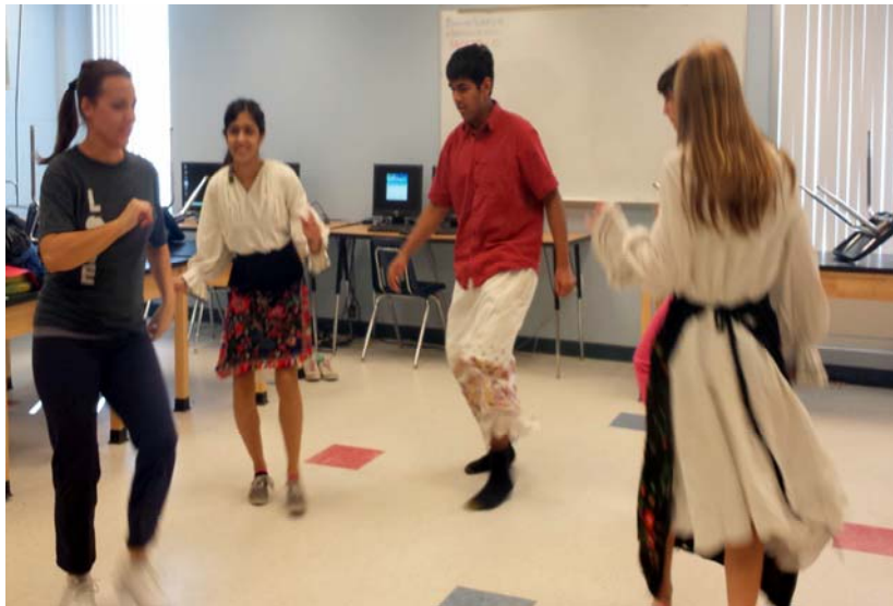
The Radost Dance Club enjoys the energetic dances best