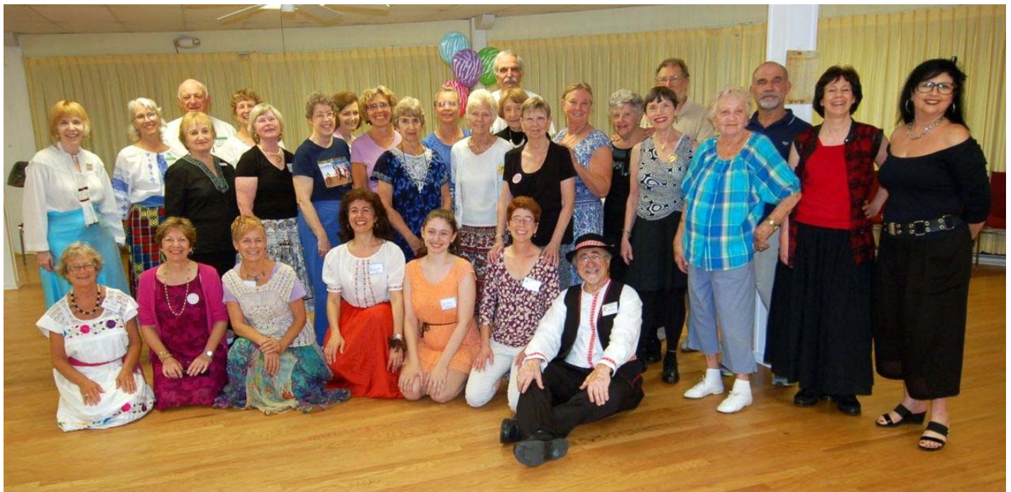
Sarasota World Dance Day Celebration