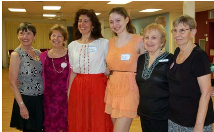
Sarasota Dance Day Committee and guests