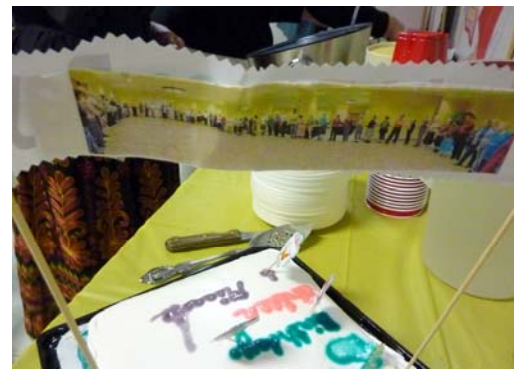
Orlando Dance Day Cake and banner

We hope everyone has a safe and fun summer. Remember that we do not dance in July and August. Come see us Wednesday nights in June, but always call first, since sometimes we have to cancel due to weather.