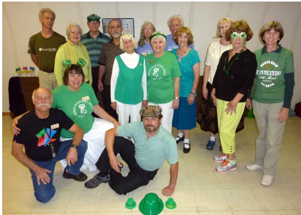
Orlando Irish Party