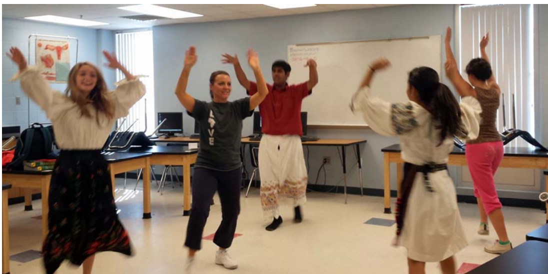
Radost Dance Club dancing Malao