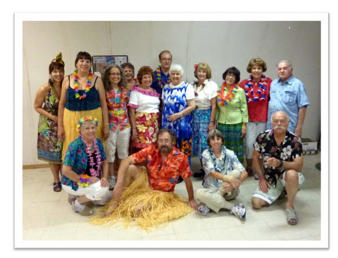
Orlando group's "Take me to Tahiti" summer send-off.