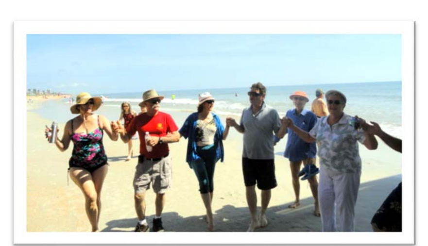
We just can't stop dancing, even at the beach!

Fling. She sat a bit, but danced a lot all day!