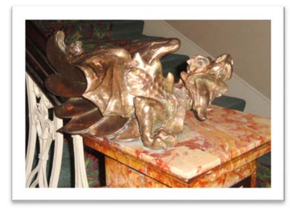
Dragon from hotel in London; designed by the same person who designed a dragon for the Titanic.

Before we knew it, the time had arrived to get off here in Florida again. What a fabulous trip, but it certainly is nice to be back home with friends and family.