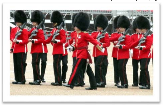
Royal Guards in London, practicing for the Queen's Birthday Celebration.

well preserved churches, walls of artists' paintings, forts, castles, endless monuments and feelings of history all around.