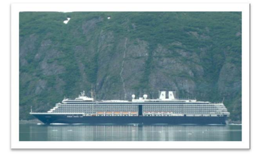
Holland American ms Westerdam

overcast or rainy, but we were able to view the famous Mendenhall Glacier, and many of the native totem poles in parks and museums. In Sitka we had some sun, which allowed us to tour this little gem with comfort and ease. Sitka has a beautiful Russian Orthodox Cathedral in the center of town, which is filled with wonderful icons.