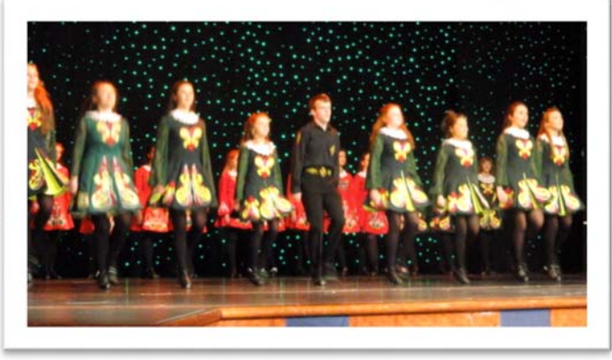
Irish Dancers performing on ship.

(one male, the rest young ladies) perform for us on stage. Of course. when they asked us to come up and participate, I had to join in while Linda filmed me. It was neat to do an Irish jig with a young Irish lass. There were smiles all around!