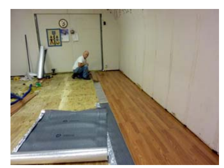
The Orlando dance floor, during floor repairs (Bobby hard at work).