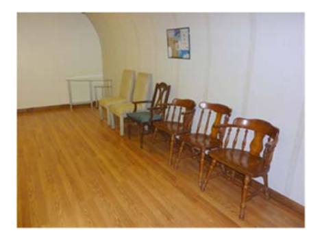
The Orlando dance floor, after.