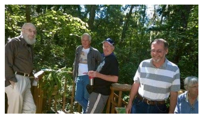
Brunch for the Gainesville group.