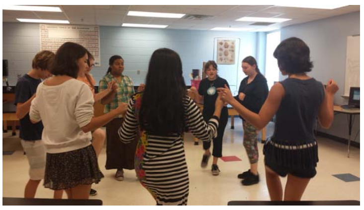
Radost Dance Club at a recent dance session.

Radost Dance Club at Vanguard High School in Ocala, FL started small this fall but we are growing. With graduations and transfers, only four students from last year returned. We had high hopes for recruitment when we per-