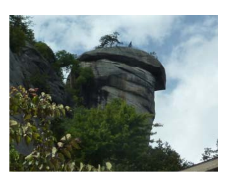
Chimney Rock State Park.

1967. Every room was filled with shelves of books along the walls. It is now a museum and was gifted to the National Park Service by his widow with the stipulation that the contents would stay intact. We had lunch and then headed to Chimney Rock State Park which was a round about way to get to Black Mountain. We took an elevator 26 stories up to the top for a gorgeous view of Lake Lure. When the workshop was over on Sunday, we toured a botanical garden that was part of the University of NC Asheville and then flew home on Monday morning.