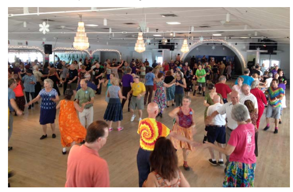
Dancers at Snow Ball

Each time I caught a glimpse of the birds swirling into the air, describing currents in space with their bodies, I knew that something had scared them off the sand. In this urban setting, the birds weren't moving for the pleasure of flocking in flight: inevitably it was because humans and their dogs walked oblivious into the shorebirds' assemblies. But I even watched people run and even stamp at the rare congre-