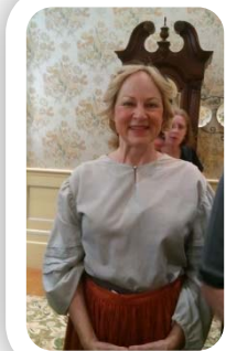
"Les Mis Chorus"