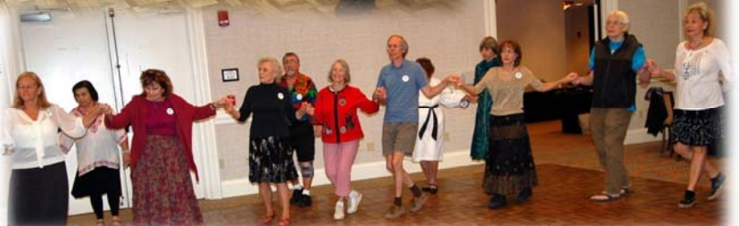
FIGURE I - Walking in Rhythm Rhythmic pattern: REMINER INSTRUCTIONS: (Six walking steps per 2 quick, 2 slow).

Meas. 1 Facing to R, take two slow walking steps in this direction continuing in same direc- slow steps (slow).