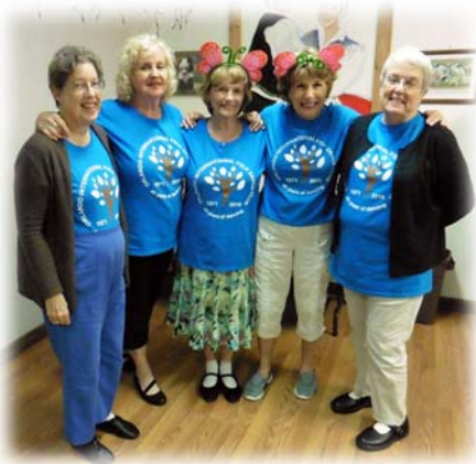
The Birthday Girls (taken April 6)

Independence Day at a local museum. Since we are starting to get younger dancers interested in dancing with us, OIFDC might have a long term future!