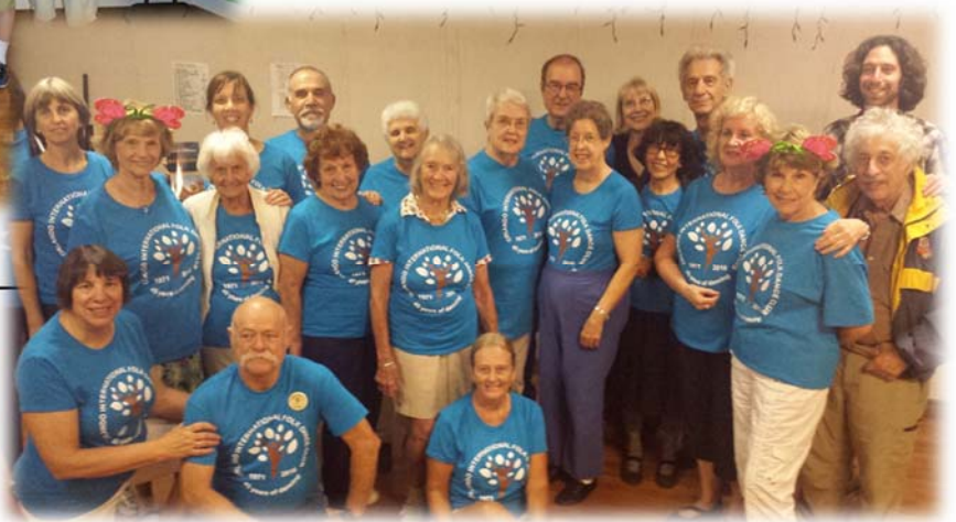
Orlando in their new t-shirts!