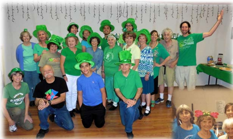
Orlando's St. Patrick Day Party (as if you couldn't tell)