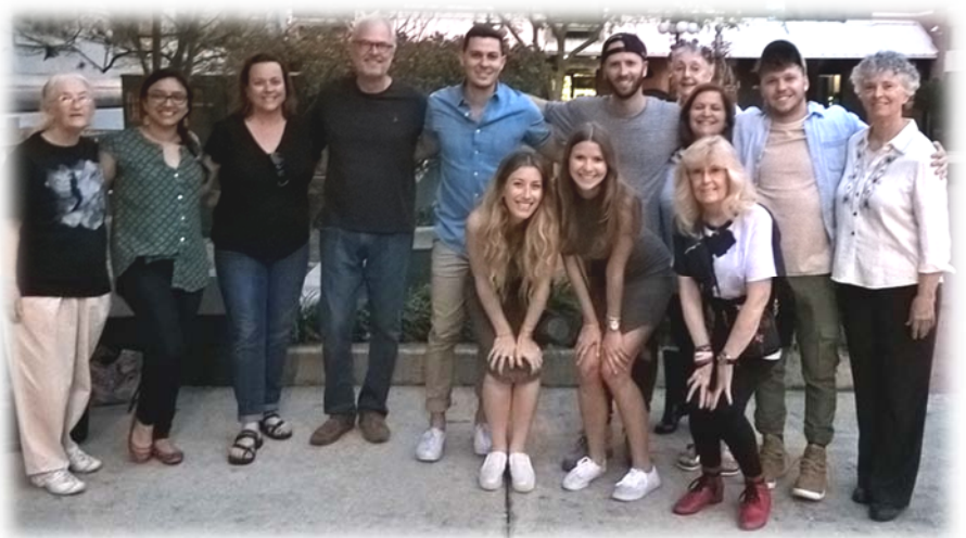
Joined by many