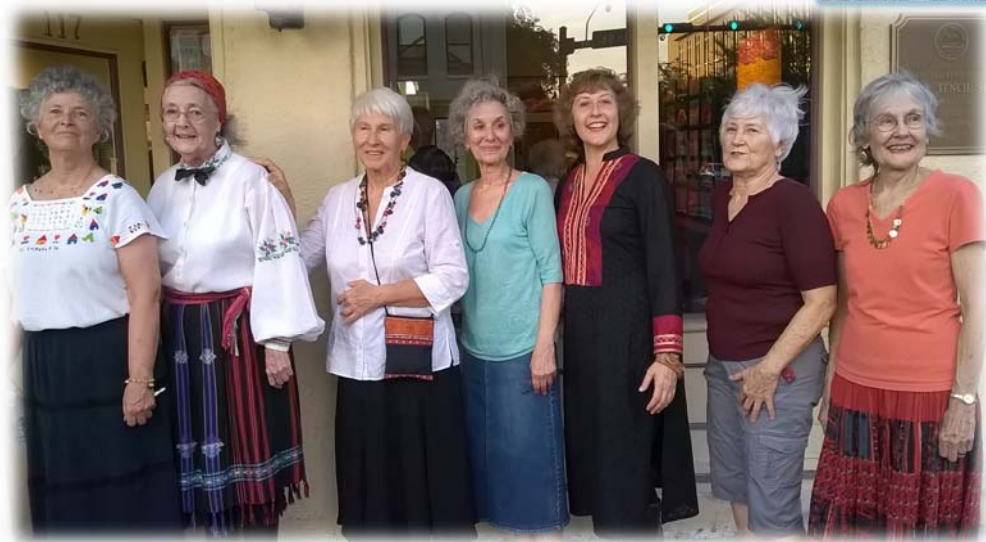
Gainesville Folk Dancers at ArtWalk in downtown Gainesville on Friday 29 May 2015.