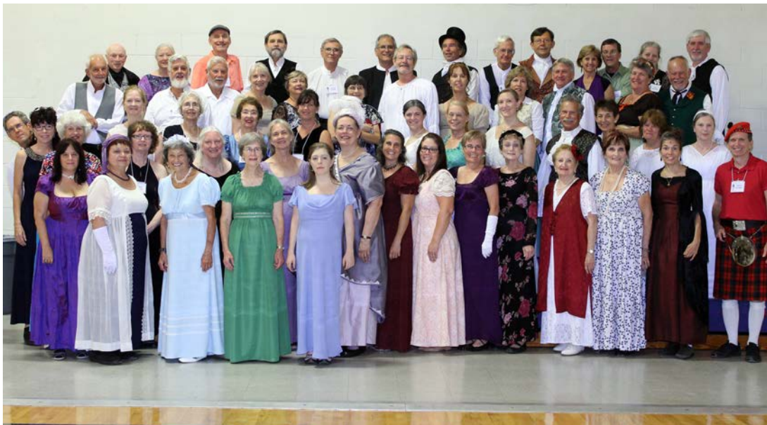
These are the dancers who were at the Saturday evening Ball in Cocoa Beach for the Sharpes Assembly.