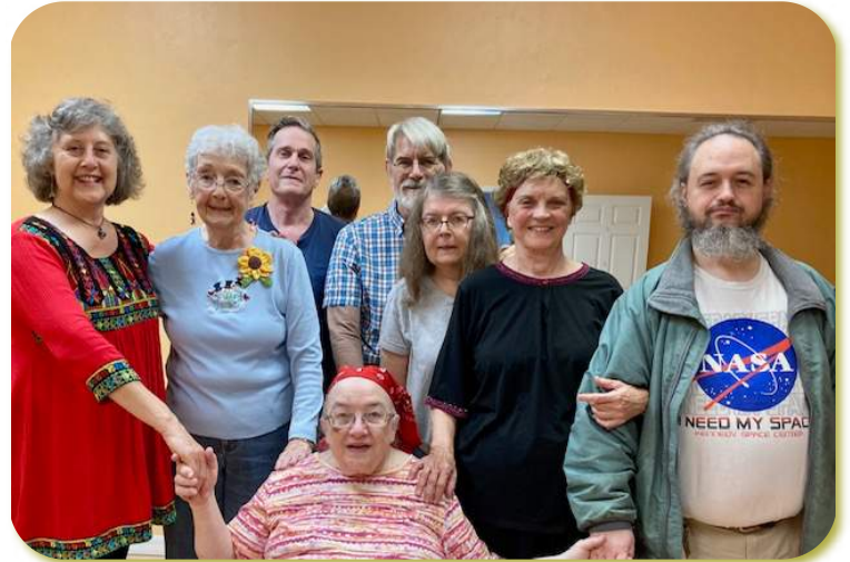
The Gainesville International Folk Dancers wish everyone a very Happy New Year. May it bring some happier times to us all.